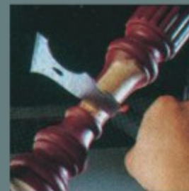
9. Convex Scraper