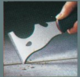
5. Cleans Out Cracks