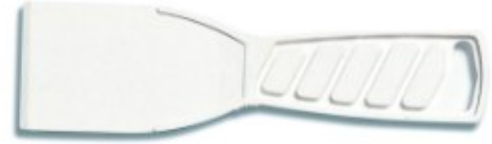
38820 2" Plastic Putty Knife.