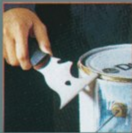
2. Opens Paint Cans