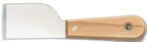
02180 S.T. P Type (36mm) Scarper, Wood Handle.