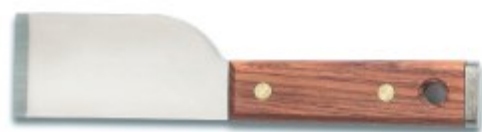
06991 S.T. P Type (42mm) Scarper, Wood Handle, w/Hammer End.