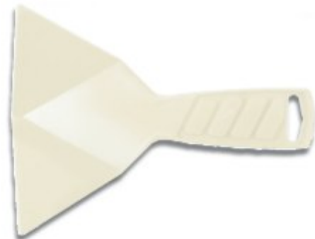
38842 Plastic Corner Knife.