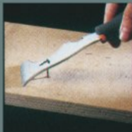
7. Nail Puller