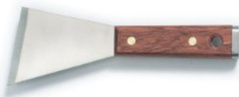
06981 S.T. Y Type (65mm) Scarper, Wood Handle, w/Hammer End.