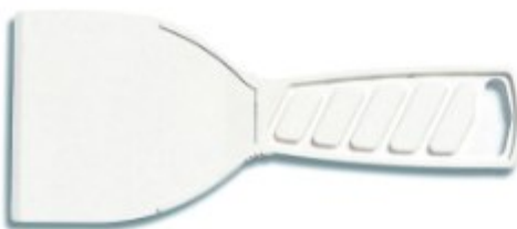
38830 3" Plastic Putty Knife.