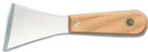
02170 S.T. Y Type (45mm) Scarper, Wood Handle.