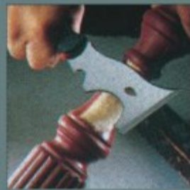
8. Concave Scraper