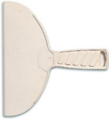
38861 6" Plastic Taping Knife.