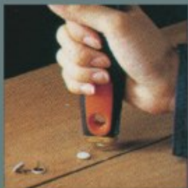
6. Set Drywall Nails