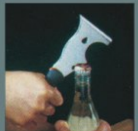
10. Bottle Opener