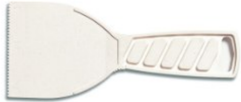
38834 3" Serrated Plastic Putty Knife.