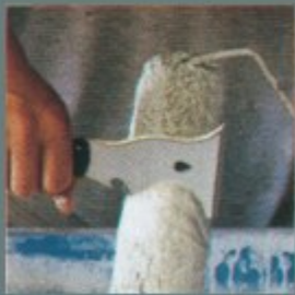
1. Cleans Paint Rollers

H.C. 03370 S.T. 04370 3" (75mm)DuraGrip 97 10-in-1 Paint Tool.