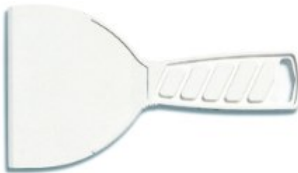
38841 4" Plastic Taping Knife.